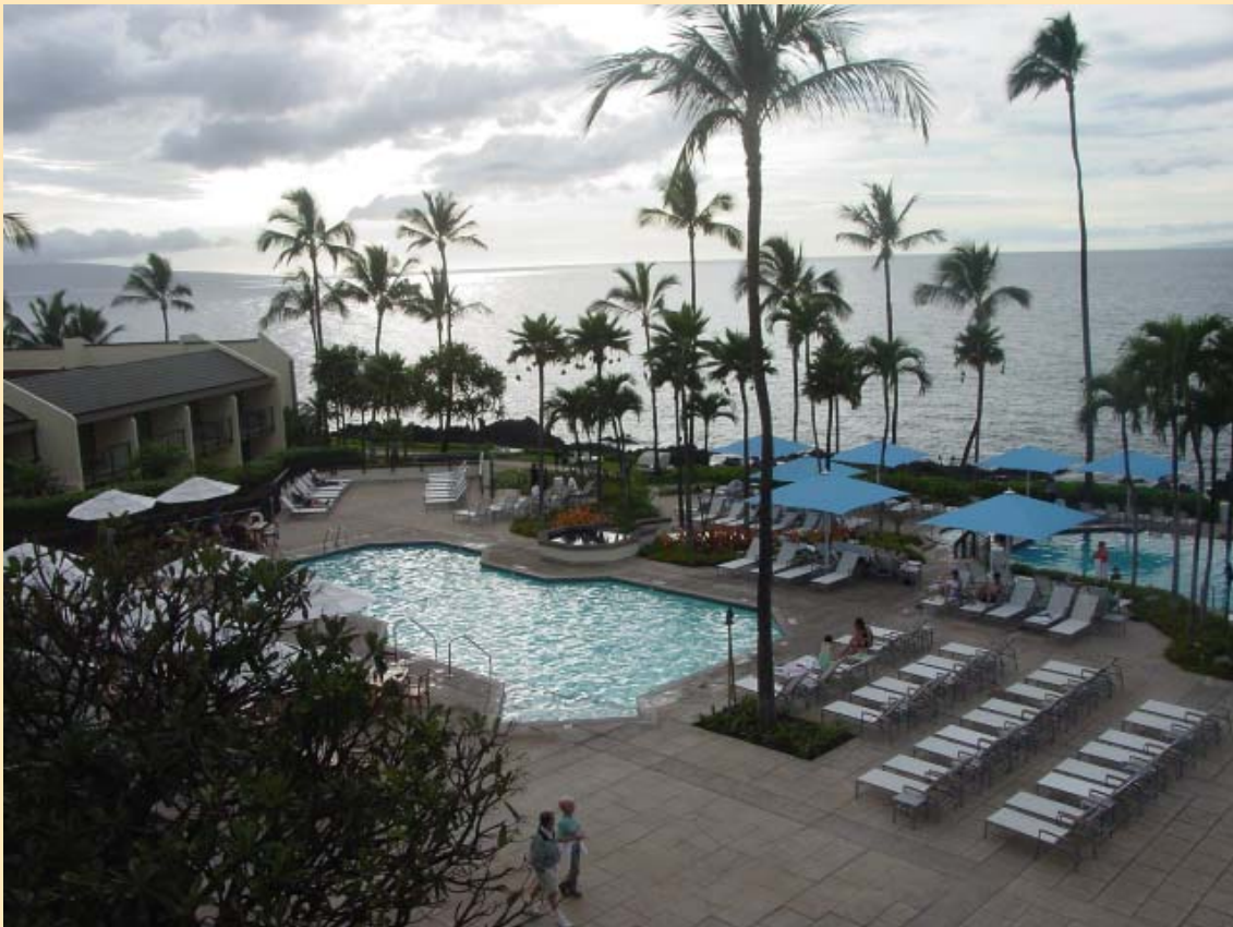
Main pool area at the Maui Wailea Beach Marriott Resort , site of the 2008 Rotary District 5000 Conference , May 23-26.