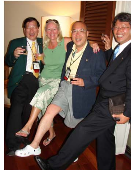
2008 District Conference: May 23-26, Maui, Wailea Marriott Resort